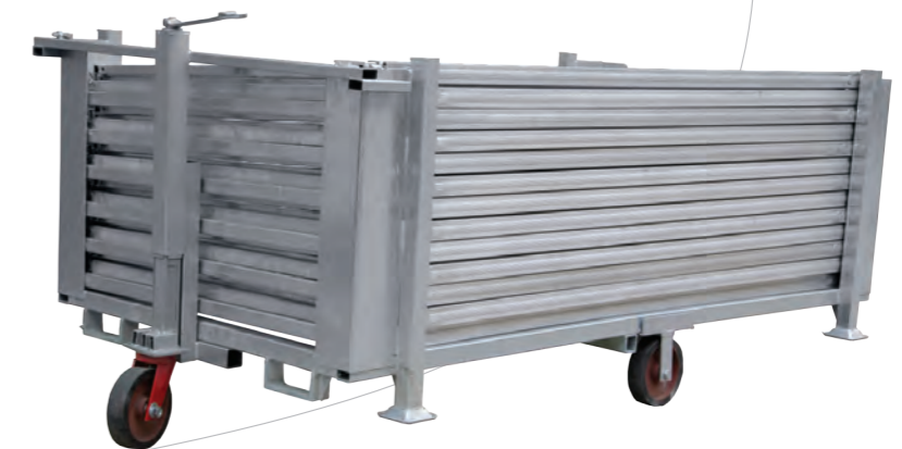
Smart Edge One Pack System