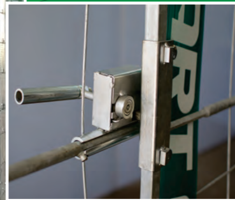
Key Lock Entrance