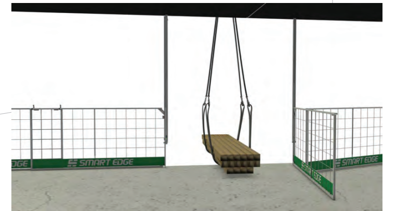
Allows for easy material import

CAUTION! Always utilize fall protection systems when exiting fenced in areas!