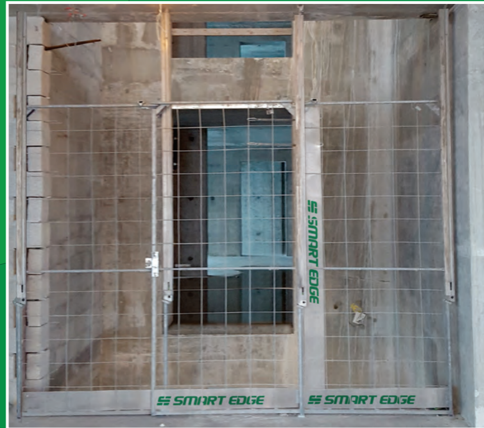
ELEVATOR SHAFT PROTECTION - Elevator Gate Lock Set