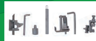
Elevator Gate Lock Set